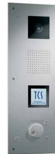
vertical model with jog wheel and video camera