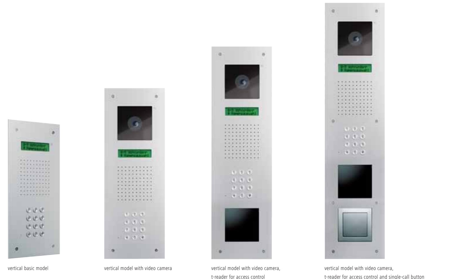
vertical basic model