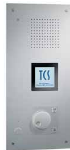
vertical models with jog wheel resp. keypad