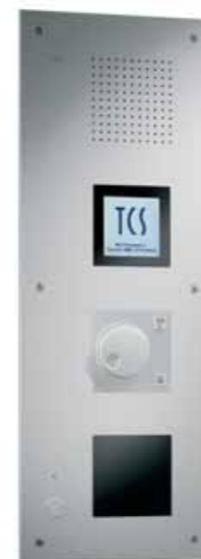
vertical model with jog wheel resp. keypad and t-reader for access control