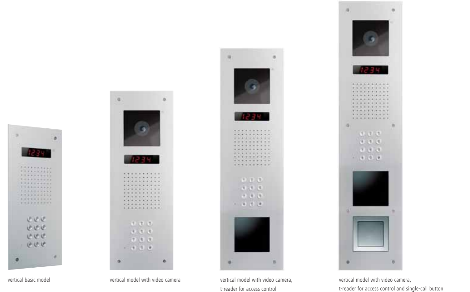
vertical basic model