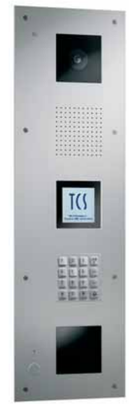
vertical model with keypad, video camera and t-reader for access control