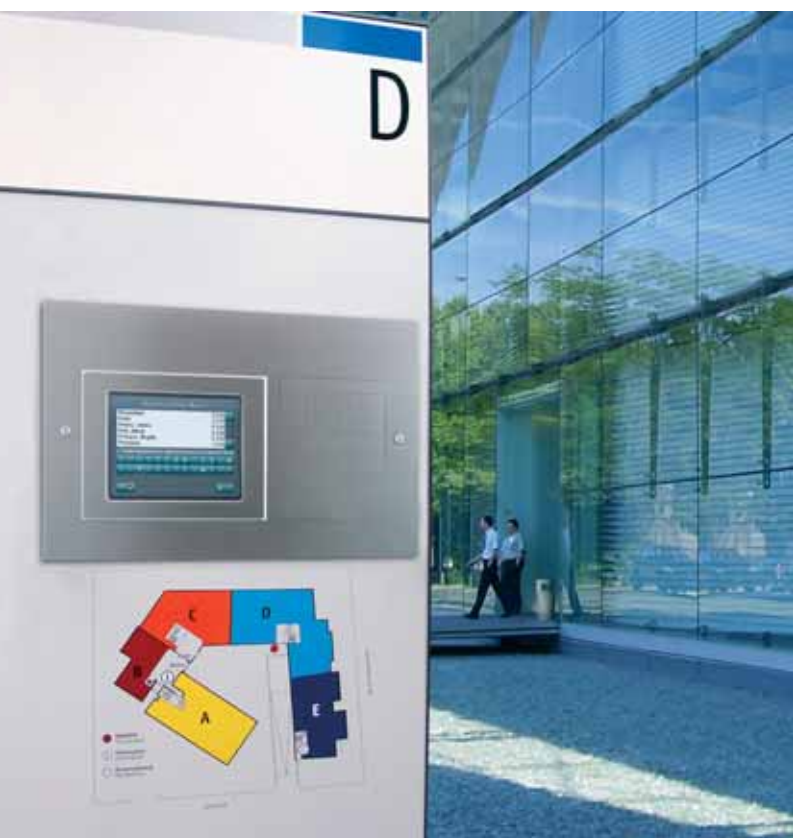
Hamburg_„CIM Center for innovative Medicine“

The color touch screen of the AD4 measures 12 inches and turns door communication into an experience. With its excellent operating quality, it is the flagship of the display family. Centrally framed by an exclusive and sturdy stainless steel front panel, the intuitive menu on the touch screen quickly guides visitors to their targets in just a few steps. During communication, additional information can be flashed onto the screen in color and in a representative size. These can inform visitors, e.g., about opening hours or display layout plans or advertising content.