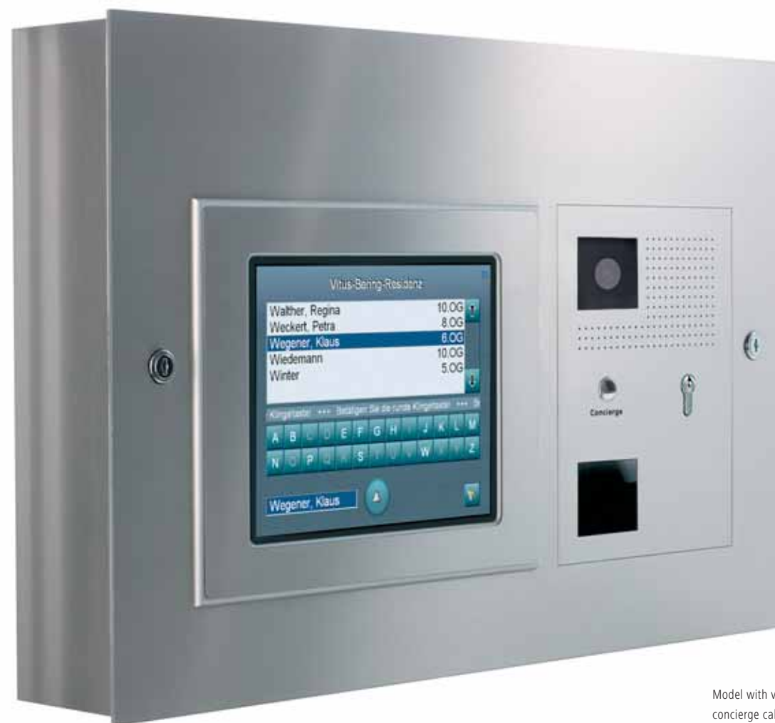
Model with video camera, access control, concierge call button and alarm system lock

If individually required, the AD4 can incorporate, for example, a video camera, mail delivery lock, scanning devices for electronic access control or a concierge call button.