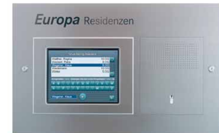
Engraved model with lock for activating the alarm system